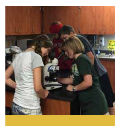
Students continue working hard through the summer to prepare experiment for flight.

businesses and national grants, we were able to raise the $15,500 necessary to participate in the program!