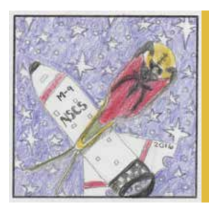
The Mission-9 patch design chosen to represent the Elementary School was designed by a 5th grade student. This student created a drawing with a Triops and a spaceship representing the mission to space.

The winning experiment "Living Water Filters: Triops in Microgravity" is scheduled to be sent to the International Space Station in November, 2016. It will return in the springtime and our students will begin the analyzation of the results.