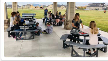
Students connecting doing activities during recess