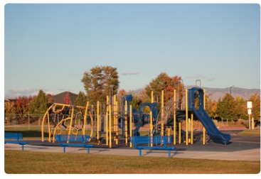
Additional Slide and Playground