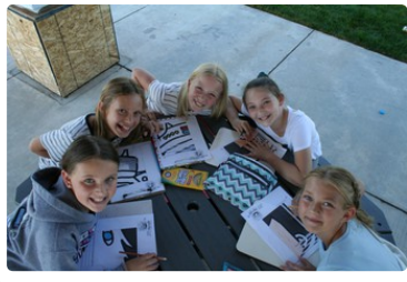
5th graders creating art