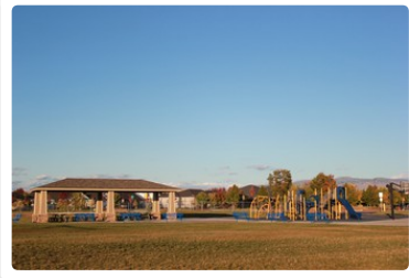
Outdoor Classroom Plaza