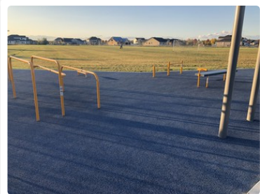
Outdoor fitness circuit