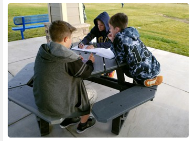
6th Grade Science collecting data